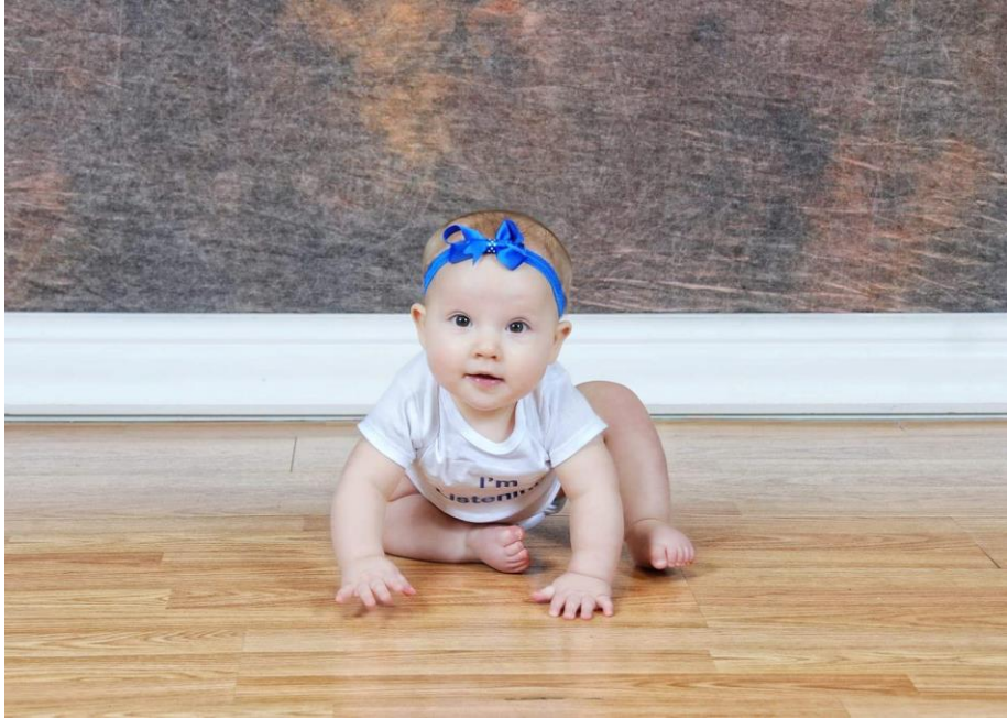
January 22 nd Post

It's here!!! Our first forum is tonight at 5:30. Learn some valuable information about the care and well-being of infants and toddlers. Come join us to for our State of the Child event, Think Babies...Because Success Starts Here.