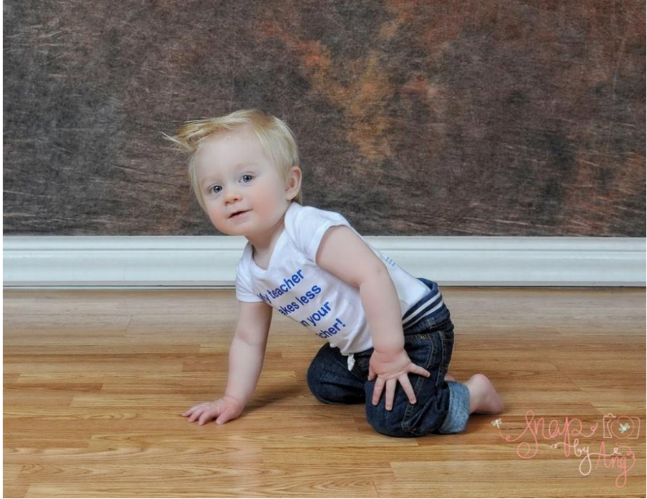
January 22 nd Post

It's here!!! Our first forum is tonight at 5:30. Learn some valuable information about the care and well-being of infants and toddlers. Come join us to for our State of the Child event, Think Babies...Because Success Starts Here.